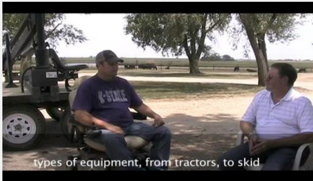
types of equipment, from tractors, to skid